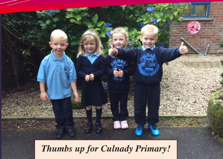
Thumbs up for Culnady Primary!

**Swimming Lessons are £1.30 per pupil. A small contribution for the swimming bus will be charged in due course. Pupils pay the class teacher on swimming days. Many thanks.